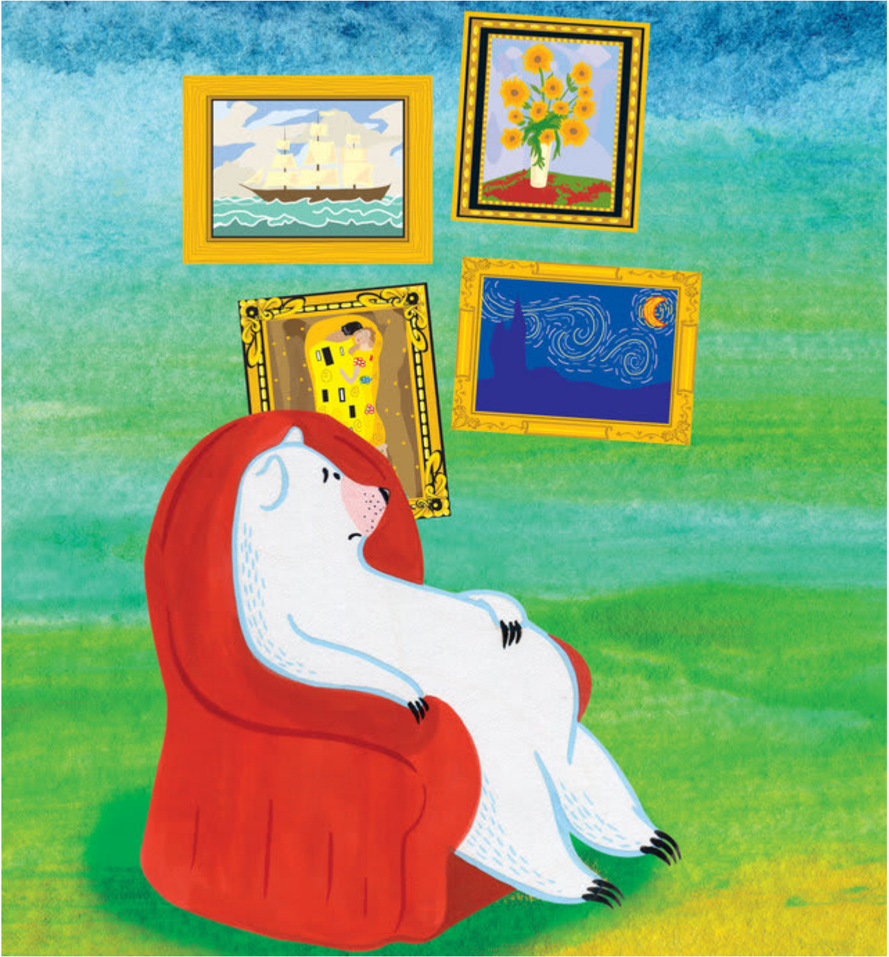
Bear likes colours.